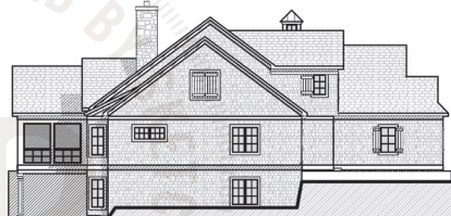
LEFT ELEVATION 1/16" = 1'-0"