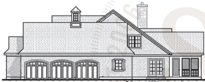
RIGHT ELEVATION 1/16" = 1'-0"

© Copyright 2006, licensed by Sketchpad Inc.