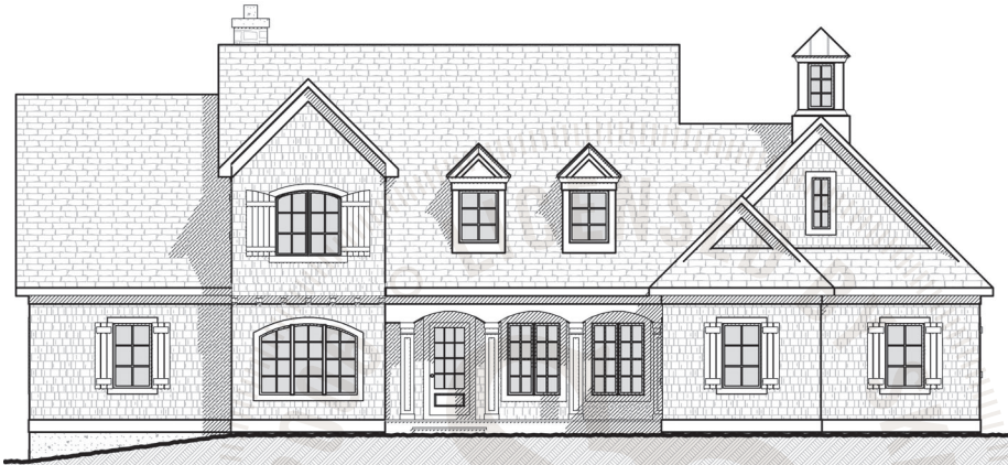
FRONT ELEVATION 1/8" = 1'-0"

© Copyright 2006, licensed by Sketchpad Inc.