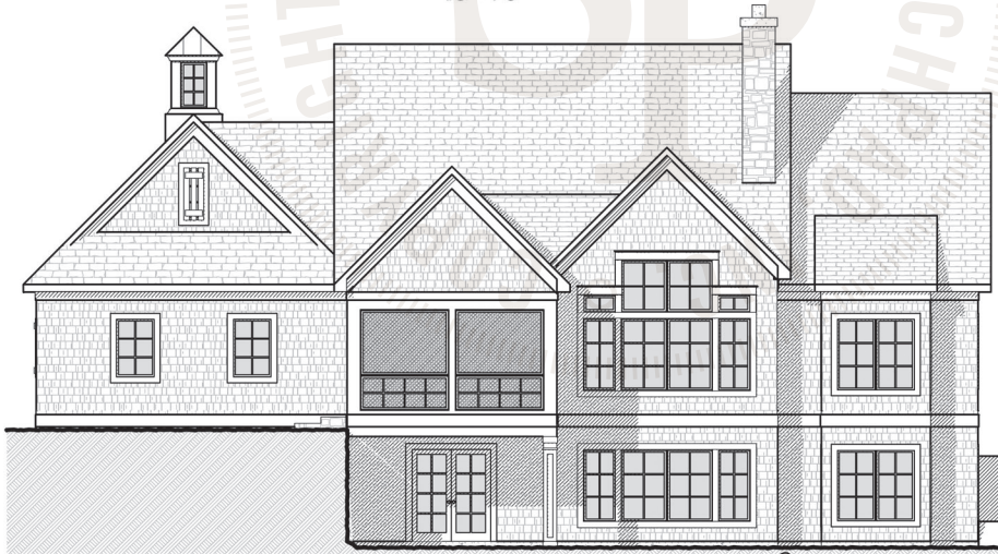
REAR ELEVATION 1/8" = 1'-0"