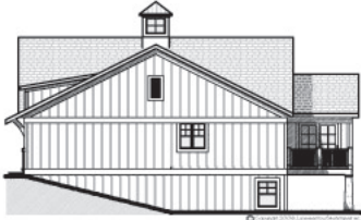
RIGHT ELEVATION 1/16" = 1'-0"