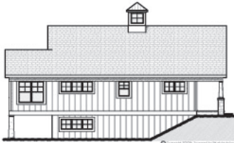
LEFT ELEVATION 1/16" = 1'-0"