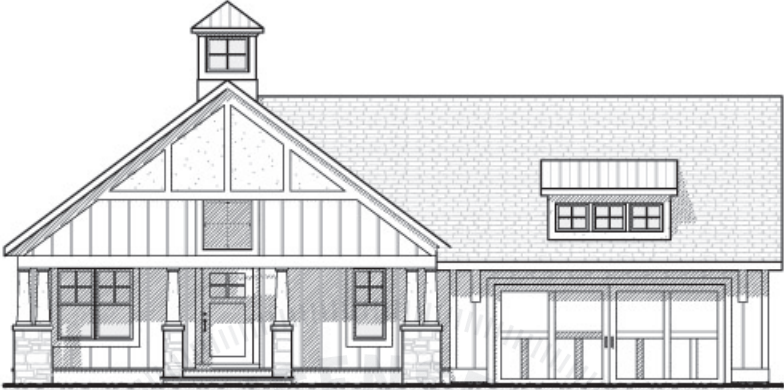
FRONT ELEVATION 1/8" = 1'-0"