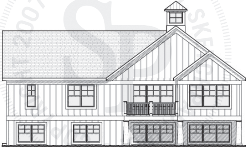
REAR ELEVATION 1/8" = 1'-0"