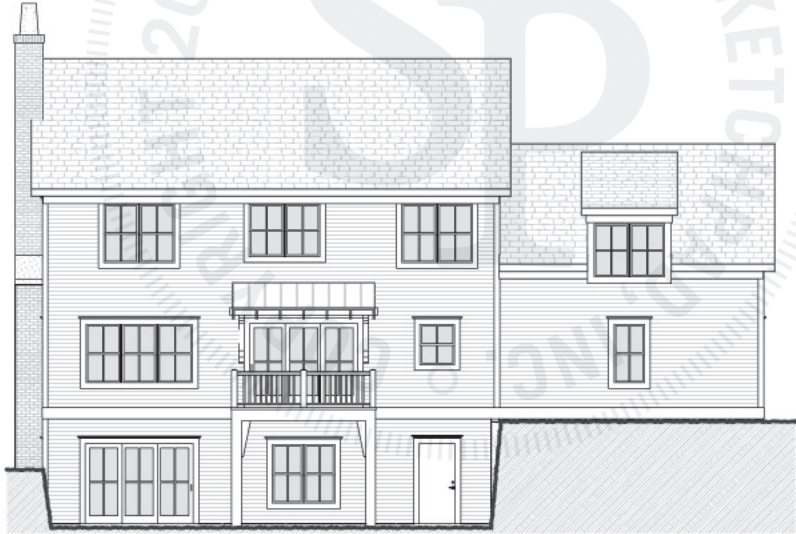
REAR ELEVATION