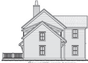
LEFT ELEVATION