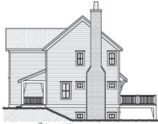
RIGHT ELEVATION