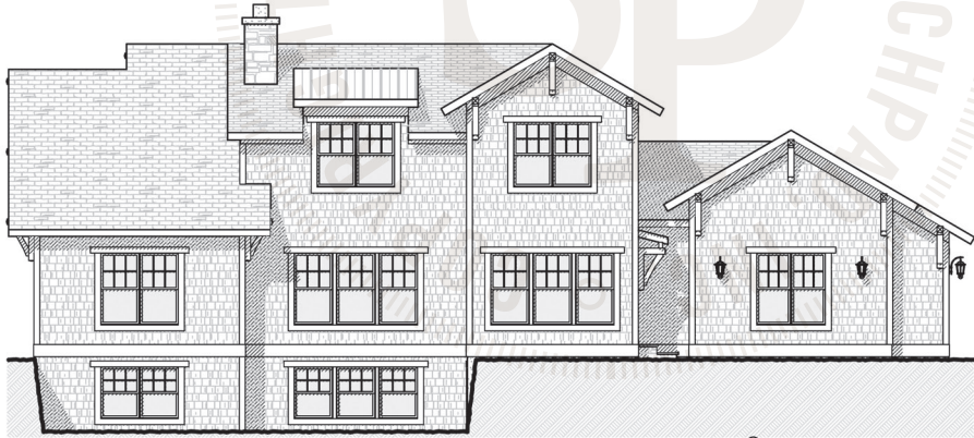
REAR ELEVATION 1/8" = 1'-0"

© Copyright 2006, Licensed by Sketchpad Inc.