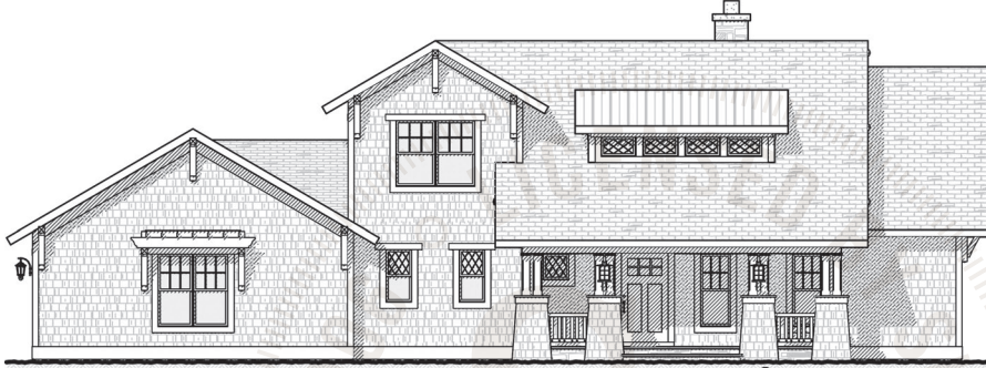
FRONT ELEVATION 1/8" = 1'-0"

© Copyright 2006, Licensed by Sketchpad Inc.