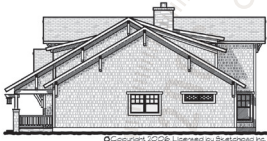
RIGHT ELEVATION 1/16" = 1'-0"

© Copyright 2006, Licensed by Sketchpad Inc.